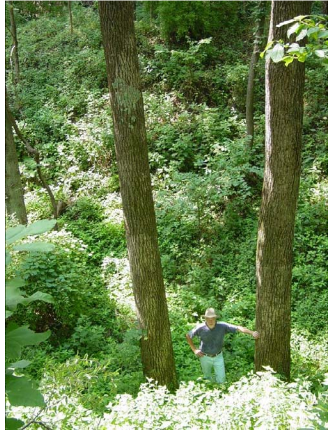
Photo 3. These 55-year-old black walnut trees were planted and grew on spoil banks in Pike County, Indiana (Photo by R. Rathfon).

Rooting medium quality: If soil replacement results in a rooting medium that is shallow or has been compacted, the site will be prone to drought and plant nutrition problems. Mine soil pH that is too high (pH>7) or too low (pH<5) and mine soils that have high levels of soluble salts can also cause plant nutrition problems. Seeds of unplanted forest species that are carried to the mine site by wind or wildlife will not germinate and grow if the soil surface is compacted or has chemical properties that are not well suited to their needs. Those grass and shrub species that are able to establish and grow on such soils will dominate on such sites, and forest succession will progress slowly. In contrast, a deep and loose growth medium that contains plant nutrients encourages invasion and canopy development by species from the native forest. These soil properties promote a diversity of trees and other vegetation and are productive for timber and wildlife.