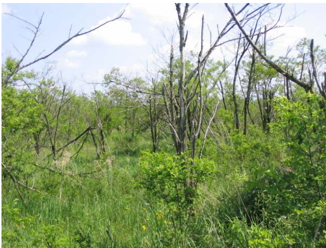
Photo 4. Black locust and grass vegetation were planted on this Garrett County, Maryland, coal surface mine in 1990. As a result, the development of natural forest community through natural succession has been delayed, a condition known as “arrested succession.”

A condition known as “arrested succession” – a failure of later-successional species to colonize a site – can occur after reclamation if principles of natural succession are ignored (see Photo 4).