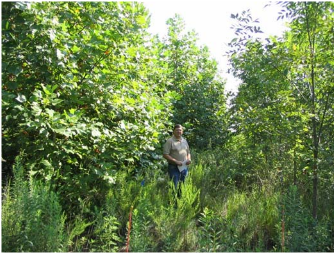
Photo 2. On this eight year old mine site in Perry County, Kentucky the following species of trees were planted: white oak, white ash, eastern white pine, northern red oak, black walnut, and yellow poplar. The high-quality growth medium on this site (loose-dumped, uncompacted mine spoils) allowed planted seedlings to achieve greater survival and faster growth while allowing more invasion by non-planted forest species, compared to an adjacent mine site that was graded using conventional practices (Angel 2006).

After harvest in natural forests, most regenerating hardwood trees grow as sprouts from well-established root systems. This type of regrowth cannot occur on reclaimed mines because those rooting systems have been removed. Unless native forest soils are used in reclamation, mine sites lack the seed and bud banks (live seeds on or in the forest floor and buds that can produce sprouts) of native forests so the vegetation immediately following reclamation is unlikely to be as diverse.