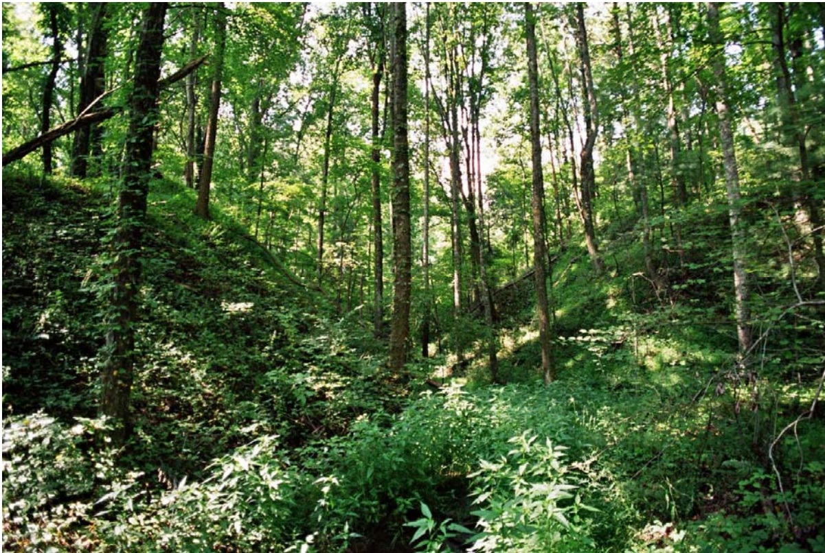
Photo 1. Succession and invasion of native species over 47 years formed a forest on this mine site in eastern Tennessee. This site was mined and reforested with various pine species and black locust in 1959 on un-compacted spoil with no planted ground cover. Succession has occurred over the years and the pine forest has been replaced with vegetation similar to the nearby native forest: yellow-poplar dominant in the overstory, red maple, sassafras and northern red oak in the mid-story, and blueberries, ground pine, Virginia creeper and ferns in the understory

This advisory describes the ways in which reclamation methods can encourage rapid succession and accelerate development of high quality postmining forests.